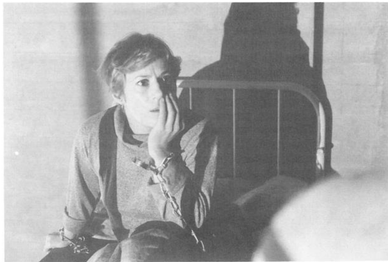
Fig. 7. The (nameless) victim of the serial killer chained to a bed.

Although for the spectator the murderer is quite literally deprived of vision because his