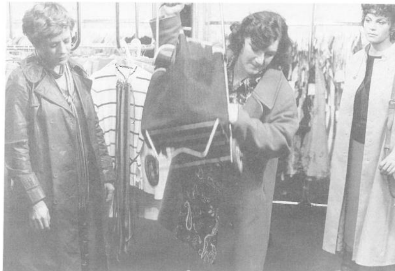
Fig. 1. The murder.

the women. Being part of the scene, and watching silently, the spectator too becomes responsible for the murder. This particular viewing position for the audience and the highly stylized way of filming the scene make the murder not realistic, but ritualistic.