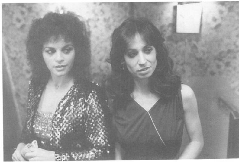
Fig. 6. Dora and Diane have become intimate friends; they share ironic jokes about the male customers.

The spectator does not share the point of view of the male customer because of the effect of the preceding sequence. The scene thus exposes the effects of the male gaze upon women. What is the effect of this cinematic perspective? At the moment that a female character makes the transition from a subject to an object position, the spectator makes the transition from a viewing position of empathy and identification to one of critical distance. This procedure returns time and again throughout the film. Broken Mirrors thus engages the viewer emotionally with the women as subjects and then makes the spectator experience almost physically the pain of woman's continuous objectification: the pain when she is deprived of her voice, her body, her desires, her freedom. Throughout Broken Mirrors , prostitution is only shown from the women's point of view. By blocking the way to identification with any of the many anonymous men in the film and by refusing any visual or erotic pleasure, the spectator is invited to reflect critically on women's objectification. The alternating positions of identification and distance involve the spec-