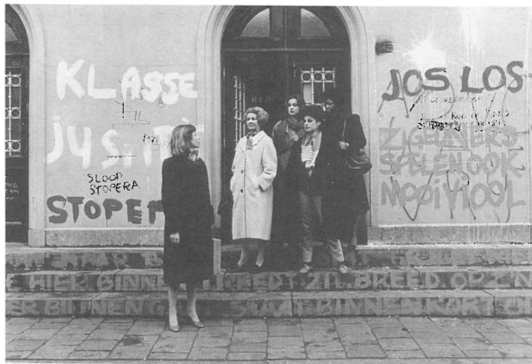
Fig. 4. The psychiatrist looking at the four witnesses outside the courtroom.

Broken Mirrors represents women's oppression as the systematic deprivation of their subjectivity. The film radically opposes two value systems: on the one hand the dominant order in which women function as objects and on the other hand the world