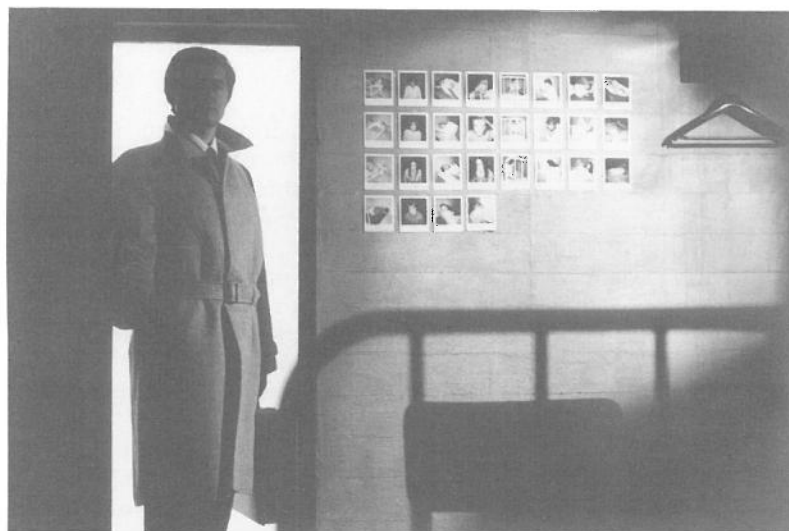
Fig. 8. The murderer leaving his victim to loneliness, darkness, and starvation. On the wall, the pictures he takes of his female victims.

Broken Mirrors never directly shows the man's pleasure in watching the submission and powerlessness of his victim; instead it focusses on the suffering of the woman. Therefore, the spectator does not understand, as she would in a classic Hollywood film, what exactly gives the man pleasure or what makes the woman guilty. For Mulvey it is fear of castration, the fear that the sight of the 'castrated' woman instills in him, which motivates male sadism. In Broken Mirrors this is suggested in the metaphor of the camera as phallus; the murderer is 'castrated' in that he does not perform any sexual act other than the surrogate of photographing the female body; a gesture that reminds very much of the impotent serial killer in the film Peeping