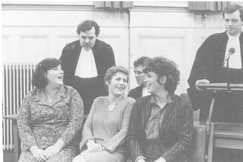
Fig. 2. The murderers laughing.

An reacts to this hostile incomprehension with laughter, setting in motion a wave of laughter among the women in the courtroom and also among the female spectators in the audience. The laughter occurs in one of the final scenes of the film which repeats the same ritualistic procedure as the scene of the murder. Looking at each other, the women begin to laugh one by one: the three murder-